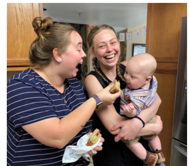
“Seeing him explore and try when he hits milestones is such a great feeling”

Thank you for loving our moms and their little ones like family.